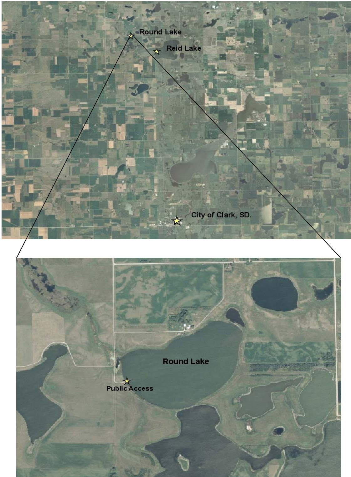
Figure 1. Map depicting location of Round Lake (including public access point) from Clark, South Dakota.